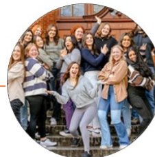
COH Peer Advisors

During your academic advising appointments you and your advisor will make course plans for the upcoming term(s), discuss opportunities, and resources relevant to your goals, track your progress toward graduation, and check-in about academic performance or concerns.